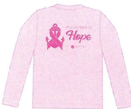
Pink Long Sleeve