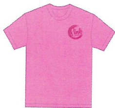
Pink Short Sleeve

The shirts will be delivered to Mammography at BMH for distribution before October 20, 2023.