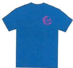
Blue Short Sleeve