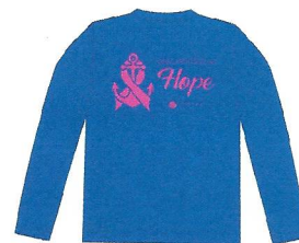
Blue Long Sleeve